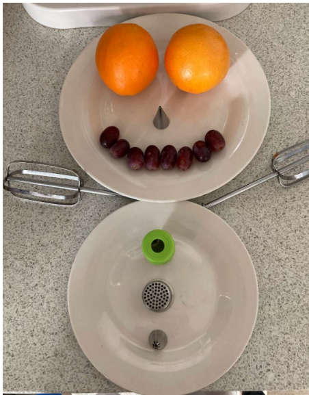
Issaq, Year 4

Use kitchen utensils from home to create different faces with different emotions.